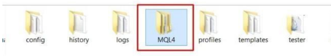
Pic.2 MQL4 Folder

Here you will find a folder called MQL4 :