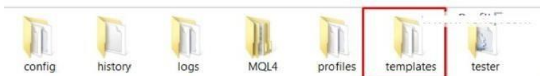
Pic.4 Templates Folder